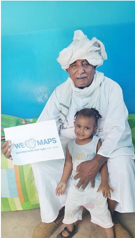
A Sudanese girl prepared for IMY.