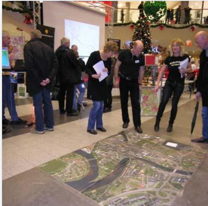
Map Day in the city of Karlstad, Sweden, 2008.