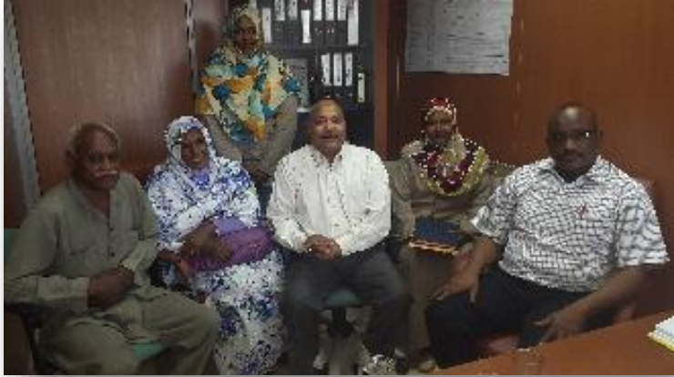
Sudanese National IMY Committee